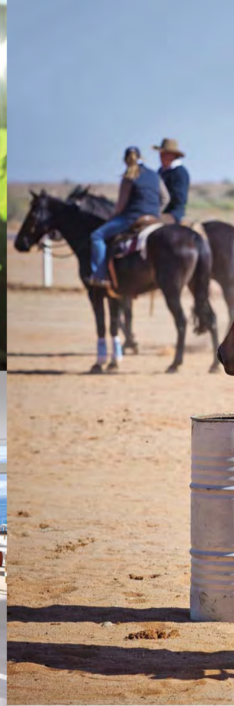
Sweetness and light Clockwise, from top left: checking the bouquet and acidity of a riesling in a Barossa Valley vineyard; horse-riding at a cattle station near