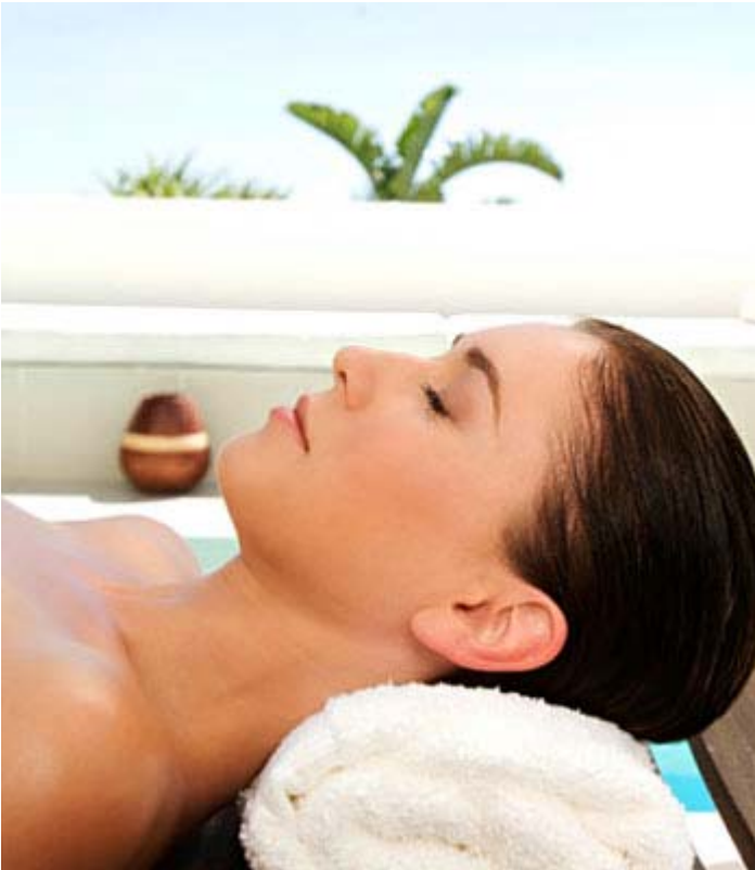
Lapping it up ... Luxury spa treatments are just what the doctor ordered.