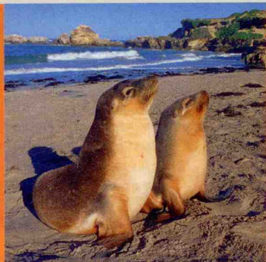
Left to right: Southern Ocean Lodge on Kangaroo Island's south-west coast; sea lions at Seal Bay; an Ocean Retreat suite.

● Hanson Bay Road, Hanson Bay, Kangaroo Island. Phone: (02) 9918 4355. southernoceanlodge.com.au . Suites from $900 per person per night (two-night minimum stay, including food and beverages).