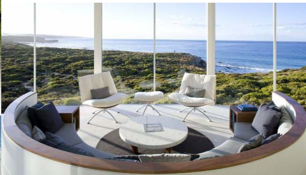
Stunning views from Southern Ocean Lodge on Kangaroo Island in South Australia.

DON'T be daunted by its distance from civilisation - visitors to Kangaroo Island are sure to experience rugged isolation in fine style.