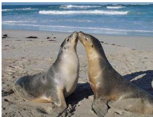
The island boasts gorgeous, untouched beaches and an abundance of life.