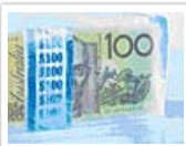
Frozen funds begin