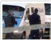
Guard shot in armed