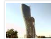
New tower leans