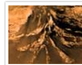
Life on Saturn's